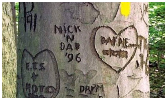
When I see lovers’ names carved on trees, I think it’s strange how many people bring knives on a date.

According to the Ukrainian government’s “Children of War” website, 503 children had been killed as of this week and more than 19,500 children have been forcibly taken to Russia.